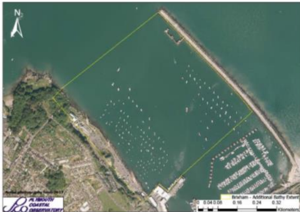
Figure 2 Brixham Harbour survey area